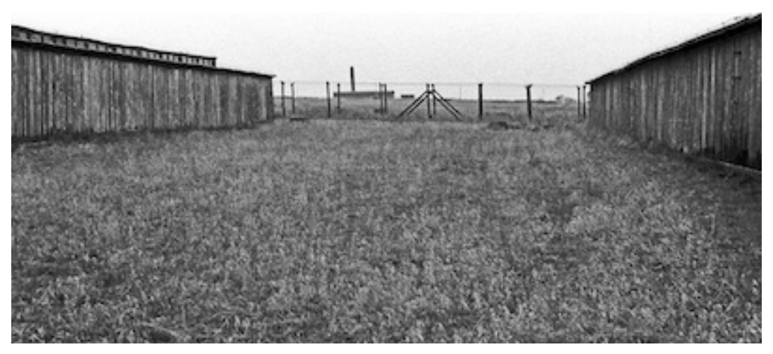
The Desolation of Majdanek

The destination was Majdanek, on the edge of the eastern Polish city of Lublin. Unlike other camps, Majdanek was not screened from public view. It was right there, the fence also demarcating the border of Polish farmers' smallholdings, as it still does. Shots and screams from the camp must surely have penetrated the air, as must have the stench from the crematorium.